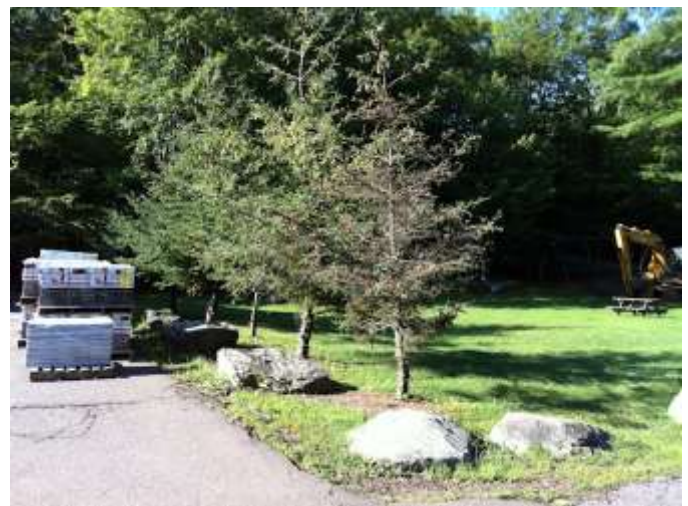
The picture above is the site before groundbreaking

The unveiling ceremony will take place September 4, 2011 at 2pm with official guests and speakers.