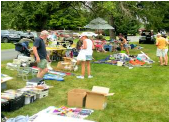
Annual Flea Market